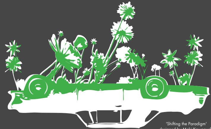
'Shifting the Paradigm' designed by Maki Kawaguchi